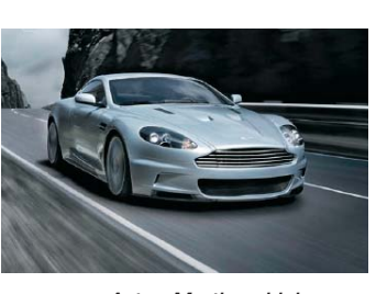
Aston Martin vehicles use an electronic key fob and mating docking station developed by STRATTEC exclusively for Aston Martin.

requirements. STRATTEC is also ISO/TS 16949 and ISO 14001 certified. This means we embrace the philosophy that quality should exist not only in the finished product, but in every step of our processes as well.